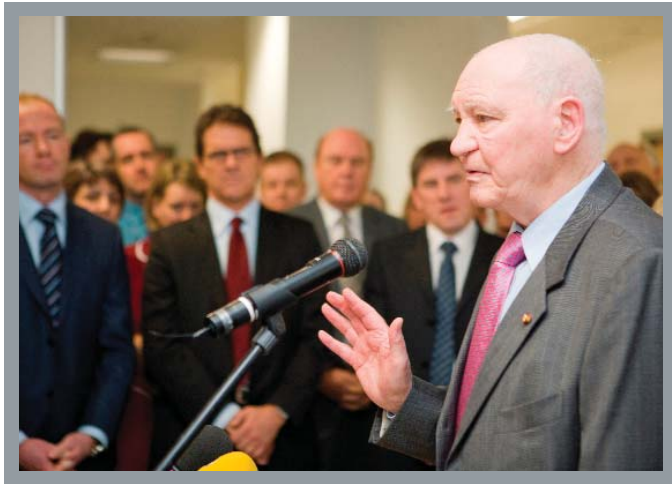
▲ The Sir Bobby Robson Cancer Trials Research Centre opened in February 2009 and Sir Bobby and Lady Elsie were joined at the launch by guests including Fabio Capello, Alan Shearer and Peter Beardsley.

The Sir Bobby Robson Foundation's initial target of £500,000 was required to equip a cancer trials research centre at the Northern Centre for Cancer Care at the Freeman Hospital.